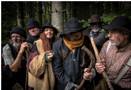
Today's 'robbers' often ravage in groups.