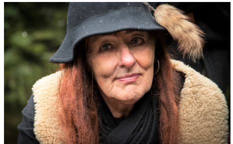
One of the female robbers as she is portrayed today.